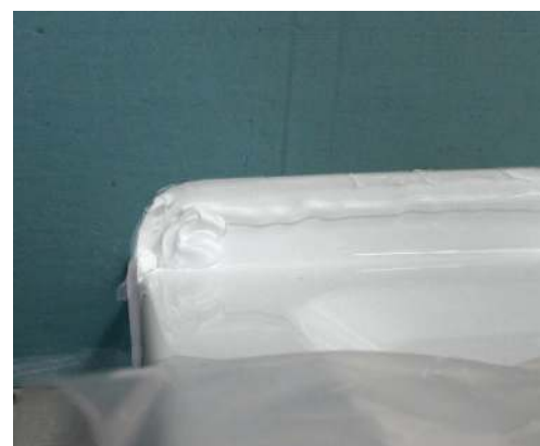
Silicone Sealant placement