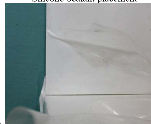
After Liner has been fitted